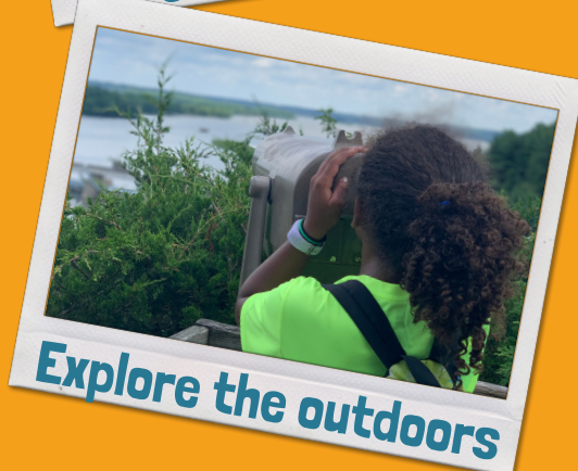
Explore the outdoors